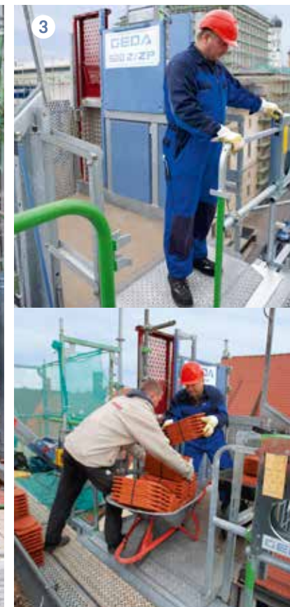
1 It's even worth using for low lifting heights.